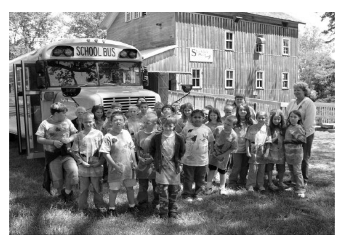
- another school group -

Our favorites from the Stockdale Mill * I liked the "shakey thing". * I liked the loud machines. * I liked the pumpkins and the elevator. * I liked going inside and seeing the elevator. * I liked where the water went through. * I liked the thing that made the water go down. * I liked the water spinning. * I liked the water. * I liked the machines spinning.