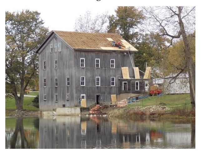
Parsons Roofing, Peru, IN installs sheathing.

aesthetics of the mill. When asked their opinion about the new roof, many visitors responded, "Really, that's a new roof? I would never have guessed. It looks like it