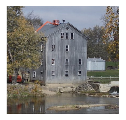
Finishing touches completed in early November, 2017

We are pleased that we have welcomed additional volunteers for hosts, tour guides, restoration project workers, and publicity. This being the sixteenth year for our Foundation, each year some of our dedicated volunteers find that they can no longer continue their efforts. Replacements are constantly needed. If you could help with a project or on a regular basis, please contact us.